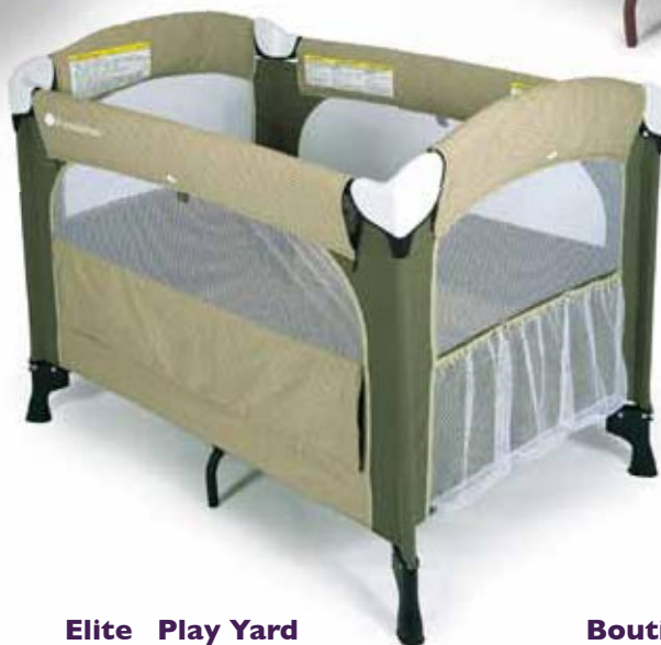
1551117 Elite Cilantro