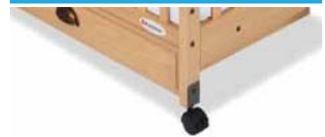
EVERCLEAR NATURAL with ANTIQUE BRASS

Ultradurable finishes with color coordinated casters and hardware