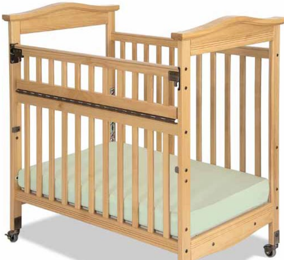
1842040 SafeReach Compact Also available in full-size.