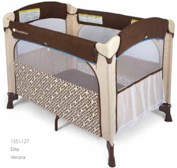
1551127 Elite Verona