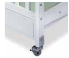
EVERWHITE with CHROME