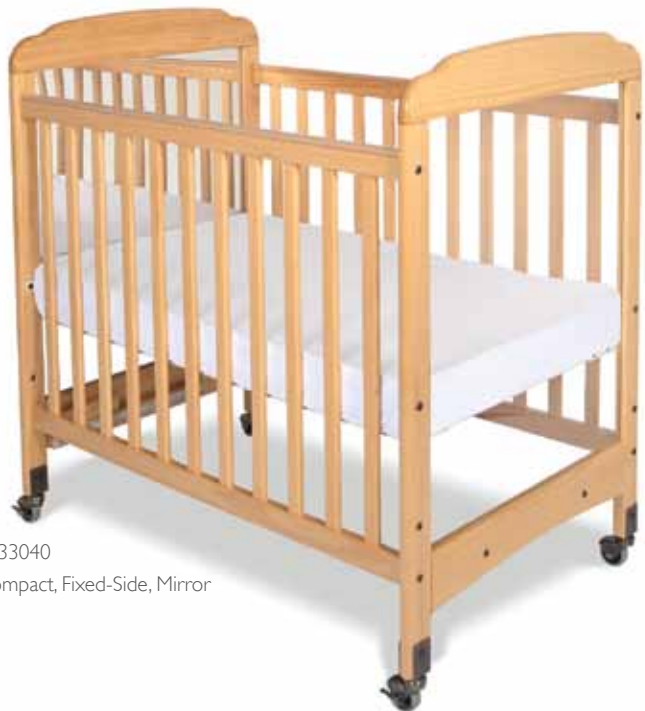
1733040 Compact, Fixed-Side, Mirror