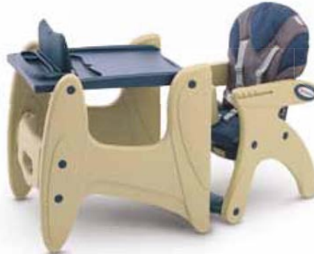
High chair converts to desk with chair