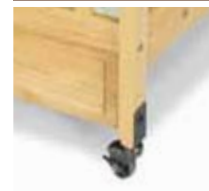
EVERCLEAR NATURAL with ANTIQUE BRASS

Ultradurable finishes with color coordinated casters and hardware