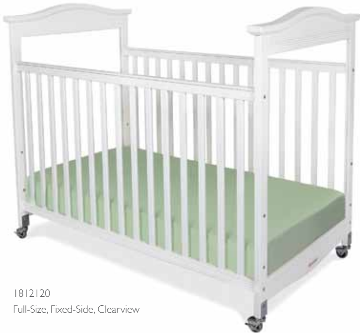
1812120 Full-Size, Fixed-Side, Clearview