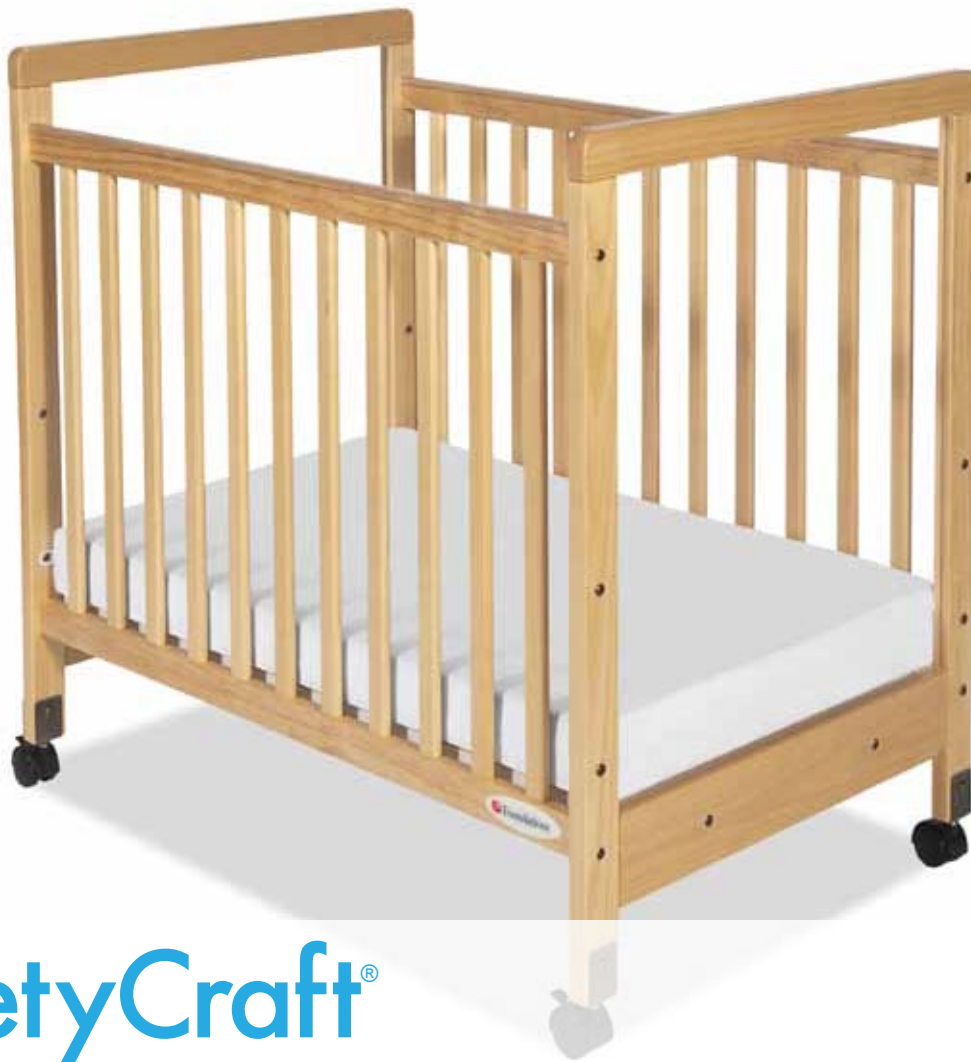
1632040 Fixed-Side, Compact, Clearview