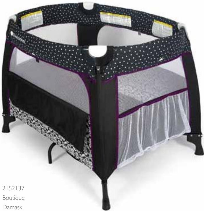
2152137 Boutique Damask