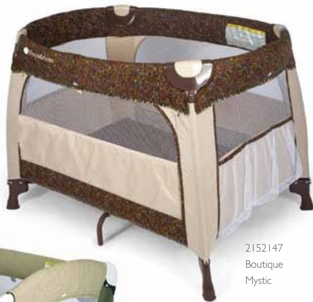
2152147 Boutique Mystic