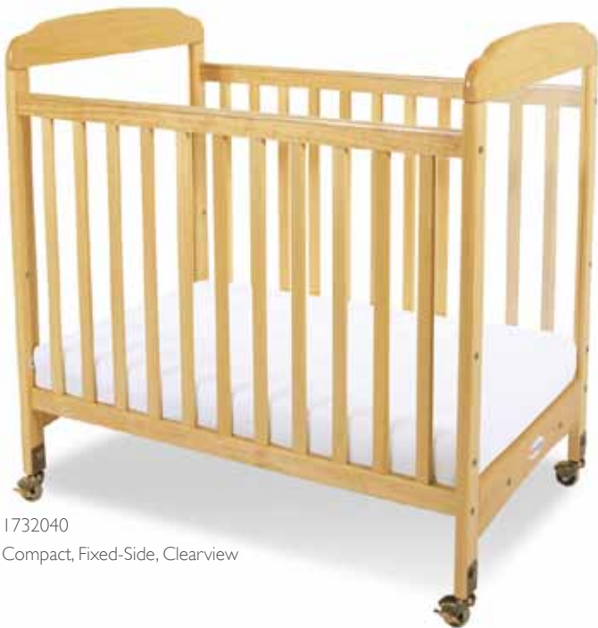
1732040 Compact, Fixed-Side, Clearview