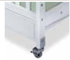
EVERWHITE with CHROME