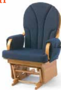
Lullaby Wood Glider

Traditional gliders feature wood base that has a durable gliding mechanism and is tip resistant for comfort and peace of mind.