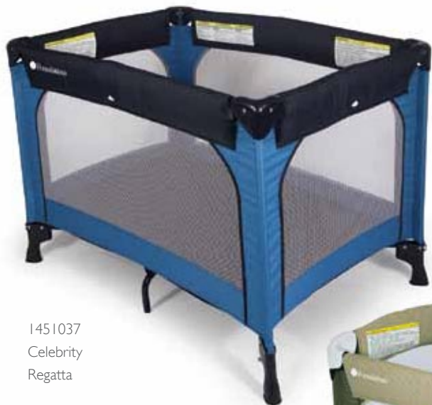
1451037 Celebrity Regatta