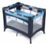
Regatta with Bassinet