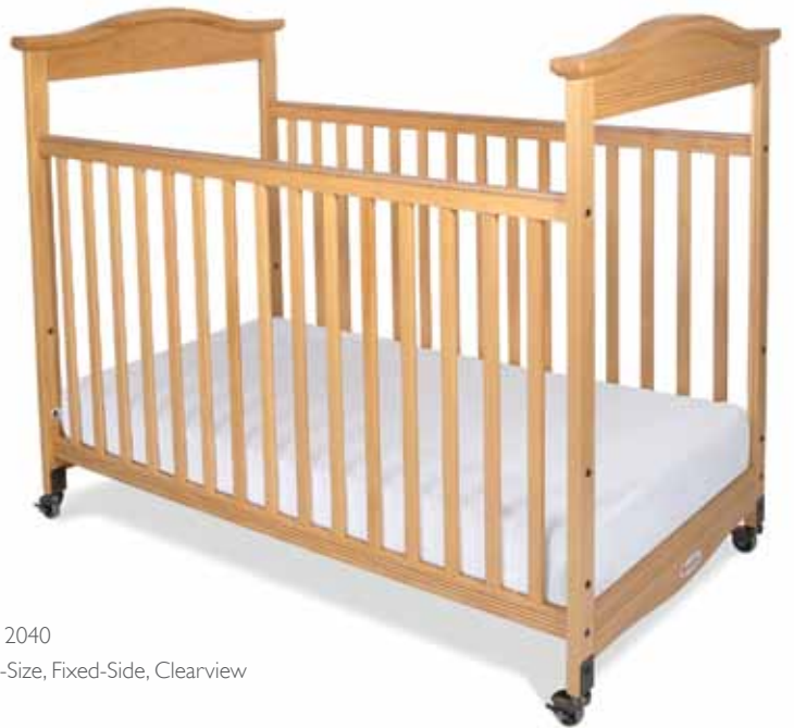
1812040 Full-Size, Fixed-Side, Clearview