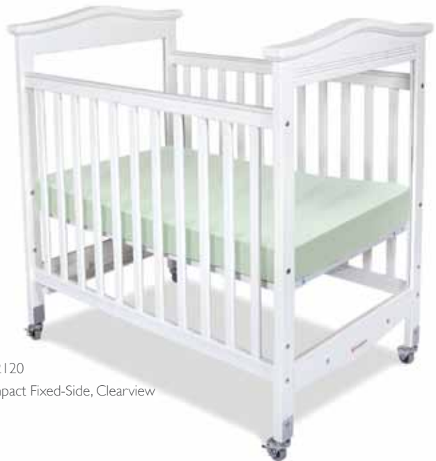
1832120 Compact Fixed-Side, Clearview