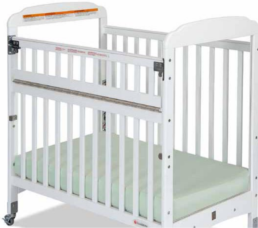
1742120 SafeReach Compact