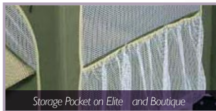
Storage Pocket on Elite and Boutique