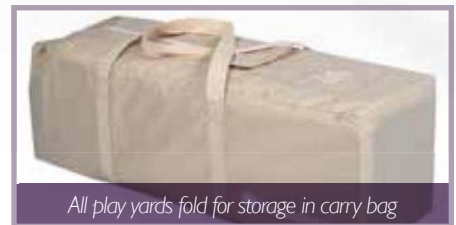
All play yards fold for storage in carry bag