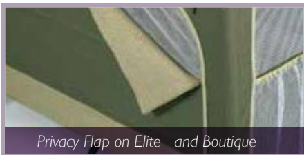
Privacy Flap on Elite and Boutique