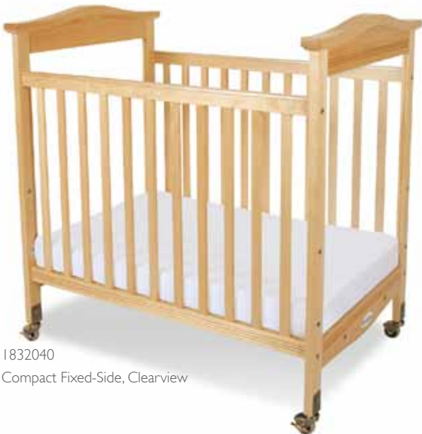
1832040 Compact Fixed-Side, Clearview