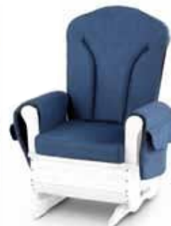
SafeRocker Wood Glider