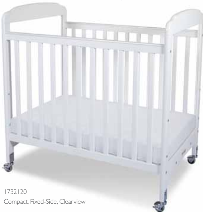
1732120 Compact, Fixed-Side, Clearview