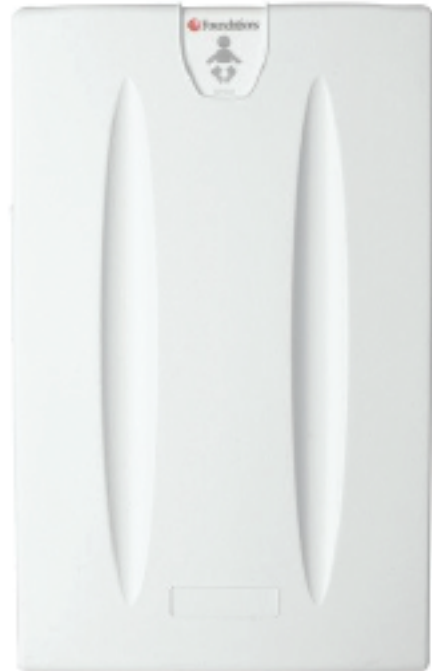
CLASSIC VERTICAL 100-EV-BP