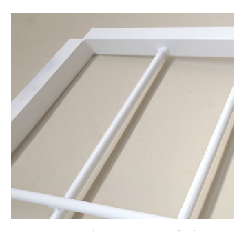
Drop In - Flange mounts below the smoke vent flange.