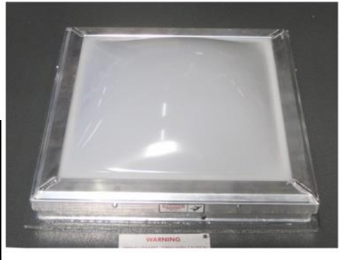
Detail of Dome Construction