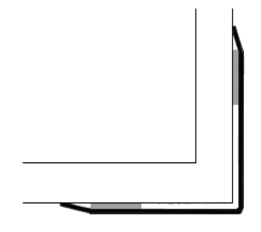
Application of Mounting Tape