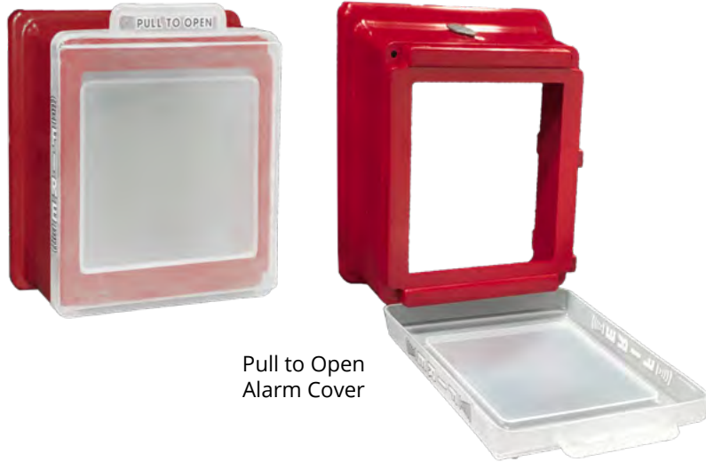
Pull to Open Alarm Cover

Cato's quality protective alarm covers, manufactured in the U.S., provides a dent and rust proof alternative to metal. It arrives fully assembled, quick to install, the cover can be opened quickly in case of emergency and remains open during inspection and maintenance.