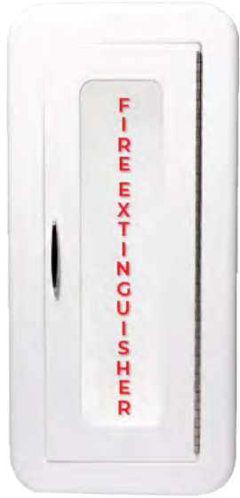
Chief Semi Recessed 405-10 W

Cato's affordable fire extinguisher series, manufactured in the U.S, provides a dent and rust proof alternative to metal. Cato's Chief Semi Recessed fire extinguisher design is built with a 2.875" trim projection and meets ADA cabinet projection requirements. The hinged door is designed with a viewable acrylic window and pull handle. A cylinder lock is available upon request to allow this cabinet to have additional security.