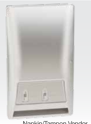
Napkin/Tampon Vendor Model 4A20