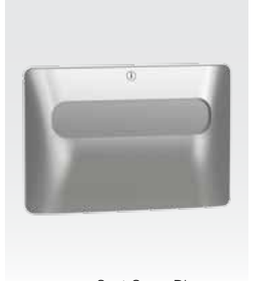
Seat Cover Dispenser Model 5A40