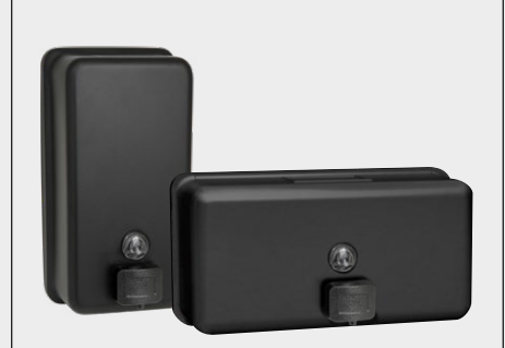
0347-41 VERTICAL SOAP DISPENSER 0345-41 HORIZONTAL SOAP DISPENSER