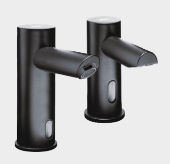
0397-41 EZ FILL™ WATER FAUCET 0394-1AC-41 EZ FILL™ FOAM SOAP DISPENSER