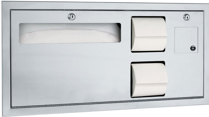
Shown above: 0487-R; below: 0487-L